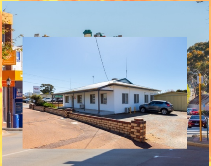
129 Federal Street, Narrogin