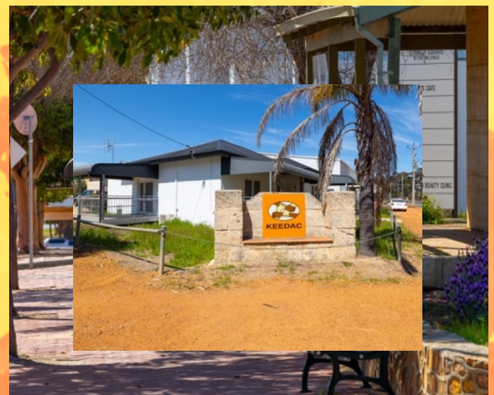
2 Grant Street, Narrogin