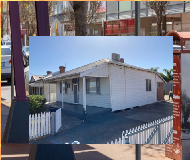
99 Wellington Street East, Northam