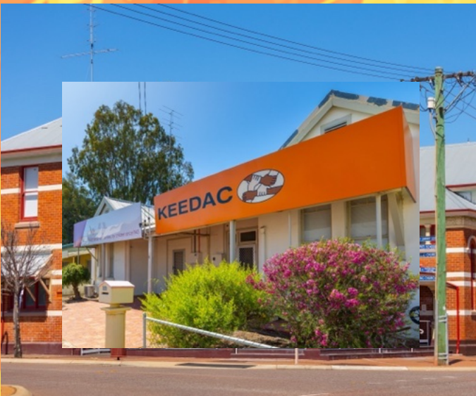
329-331 Fitzgerald Street, Northam